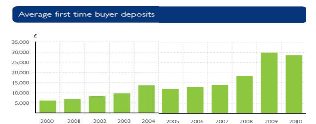
Table 1 – Average first time buyer deposits 2000 – 2010

1.8 Table 2 below brings together the latest information on the prices of different types of properties within the county.